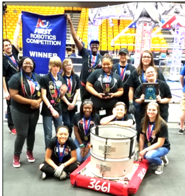
Students pictured above at the Robotics Competition.