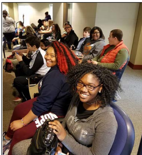
Youth getting ready for the district meeting at 4-H Winter Enrichment.

Four 4-H'ers attended this year's South Central District Winter Enrichment. The event was held on the campus of UNC-Charlotte January 21 st . Participants enjoyed workshops, campus tours, lunch at the student union and the day was capped with group activity to DefyGravity Trampoline Park. A good educational day was had by all.